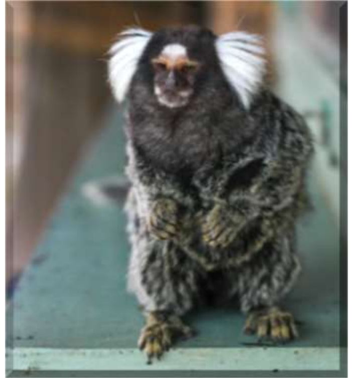
Pictured: Marmosets originate from South America

A marmoset was found monkeying around at a train station near Glasgow, Scotland last month after it escaped from its home. The primate was spotted sitting alone on a handrail, minding its own monkey business and railway staff were concerned for its welfare. So, at 3pm a spokesperson from ScotRail posted on social media, "I've dealt with lost phones, handbags and glasses over the years, but this is definitely a first! If you've lost your monkey... it's waiting on the next service from Cambuslang into the town." Marmosets originate from the tropical rainforest in South and Central America but can legally be kept as pets in the UK. They mainly eat sap and gum from trees, but they also eat the leaves, fruit, seeds, and flowers. In the wild, they eat insects, snails, lizards, frogs, and baby birds. Someone recognised the marmoset from the photo on Twitter and tweeted back its owner's address. The marmoset was reunited within three hours. ScotRail tweeted another photo of the cute creature later tucking into a can of fruit.