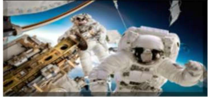
Pictured bottom: Astronauts in space